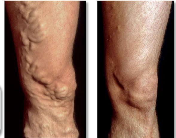
Before & after treatment with Varisolve ® after 1 yr